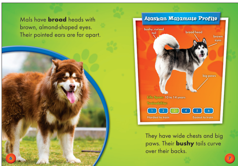
Sample spread from Alaskan Malamutes